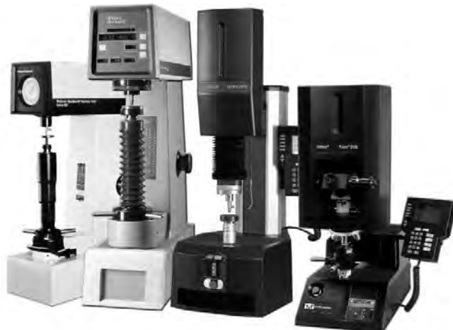
▲ Hardness family.

Bench model testers are available in a wide range of vertical capacities: the smallest is approximately 6 inches and the largest as great as 14 inches. The throat depth for most models is approximately 5¼ inches. In choosing the vertical capacity, not only must the size of the part be considered, but also the size of the anvil or supporting fixture.