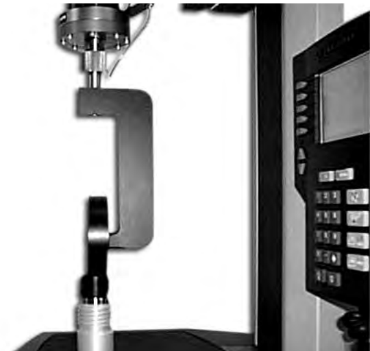
▲ Gooseneck extension for ease of internal testing.

Tubes and hollow pieces must be supported by a mandrel to ensure rigidity under the test loads. This will prevent the tube from deforming under the major load, thus causing a lower hardness reading.