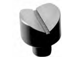
▲ Standard V.

In some cases, testers may be used, which for reasons of speed or portability, do not perform a standard Rockwell test. Caution should be exercised when reporting results from these testers, as the readings may not be identical to those made on a standard Rockwell® hardness tester for all scales, materials, or part geometries.