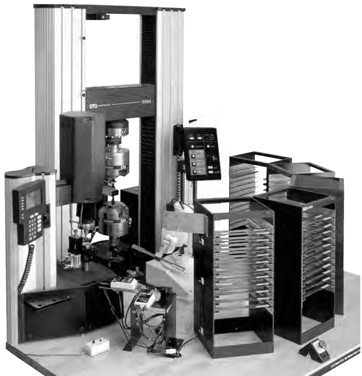
▲ Rockwell series 2000 tester integrated with Instron® universal test system designed for automatic loading and testing with a robot.

The standard Rockwell test requires approximately three to six seconds to complete the loading, testing and unloading cycle. The custom high-speed hardness tester can be designed to require less than one second to go through the same cycle. There is considerably less time for plastic flow of the sample during the test. This difference in time can produce small but measurable differences in depth of penetration between the standard Rockwell test and the high-speed test. Therefore, the manufacturer cannot claim that the high-speed tester performs a true Rockwell test, but it does produce a test that gives similar results. For ease of application, the high-speed tester is calibrated using standard Rockwell test blocks.