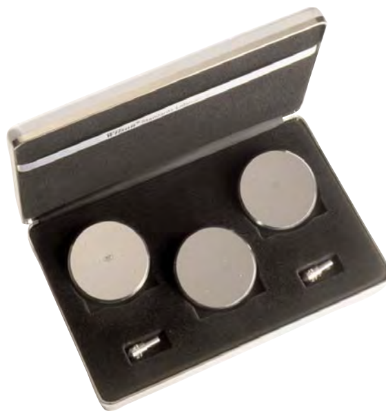
▲ Rockwell calibration set.