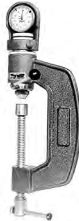
▲ Wilson Instruments portable model M3.