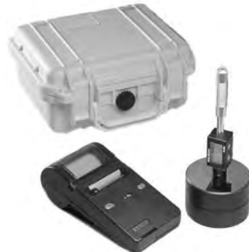
▲ Wilson Instruments model M-250 Portable LEEB type hardness tester with printer.