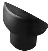
▲ Shallow V.