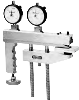
▲ Wilson® Instruments mobile model M51.

The Rockwell tester, while a rugged piece of equipment, is also a precision instrument with many features suitable for production testing. To utilize this instrument to its full potential, consideration must be given to the factors governing selection of the appropriate scale as well as the curvature of the specimen and the importance of adequate support under test. With all limiting factors taken into account and with properly designed equipment in good calibration, the Rockwell test can be a versatile procedure capable of measuring small differences in hardness.